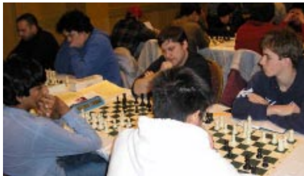
The Winning US Amateur Team in Action

1.e4c5 2.Nf3 Nc6 3.d4 cxd4 4.Nxd4 Nf6 5.Nc3 e5 6.Ndb5 d6 7.Bg5 a6 8.Na3 b5 9.Bxf6 gxf6 10.Nd5 f5 11.Bd3 Be6 12.0-0 h5 13.c4 fxe4 14.Bxe4 Rc8 15.cxb5 Nd4 16.Nf4 Qg5 17.Nxe6 fxe6 18.f4 Qg7 19.bxa6 d5 20.fxe5 Bc5 21.Bd3 h4 22.Kh1 Ke7 23.Rf6 Nc6 24.Rg6 Qxe5 25.Qe2 Bxa3 26.Qg4 Bxb2 27.Rb1 Nd4 28.Qg5+ Qxg5 29.Rxg5 Rc1+ 30.Rxc1 Bxc1 31.Rg7+ Kd6 32.a7 Ra8 33.Rg4 e5 34.Rxh4 Rxa7 35.g4 Rxa2 36.Rh8 Nf3 37.Bf1 Bf4 and time expired on white. 0-1